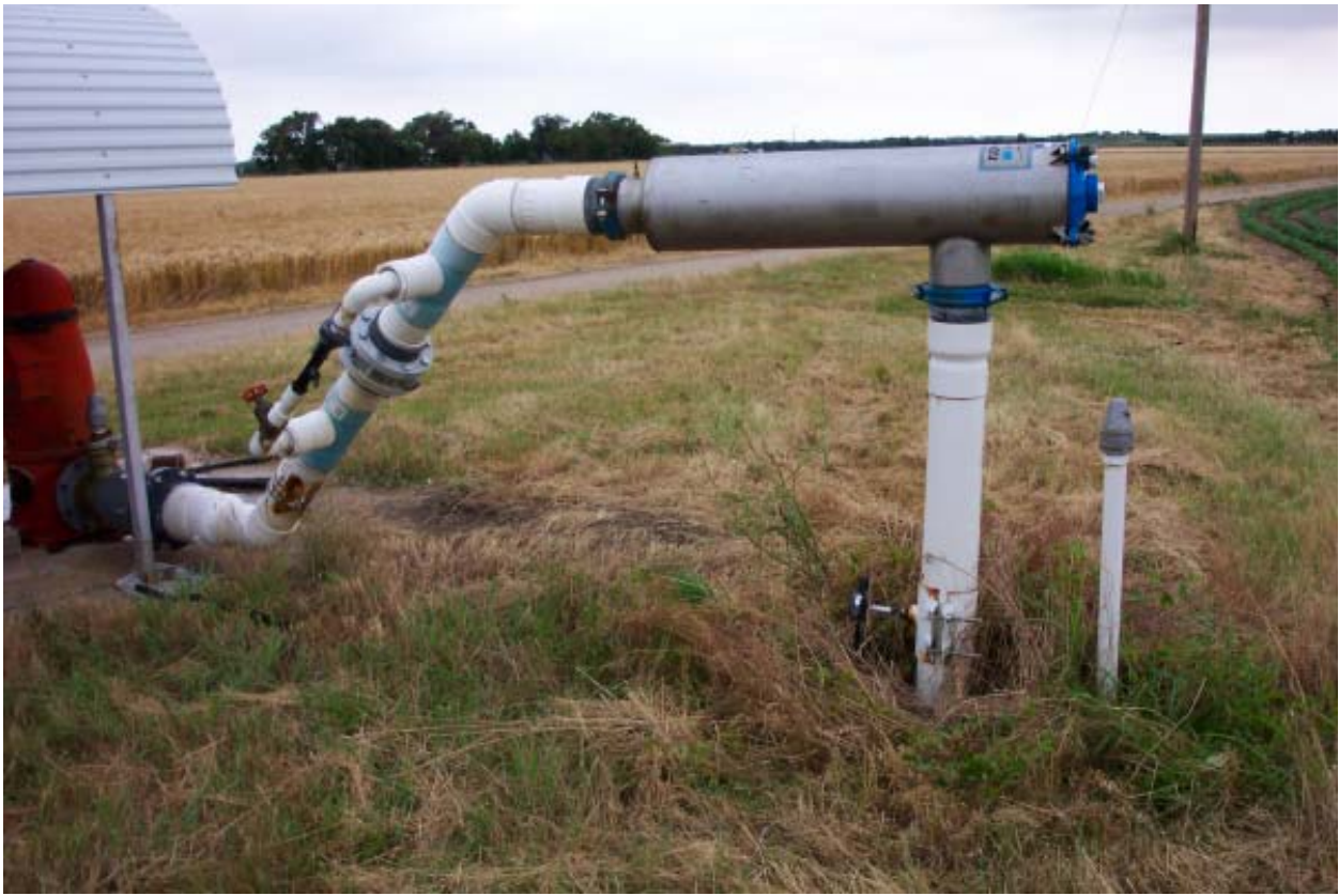
Figure 3a: Original pumping plant and filtration configuration of the case study SDI system.