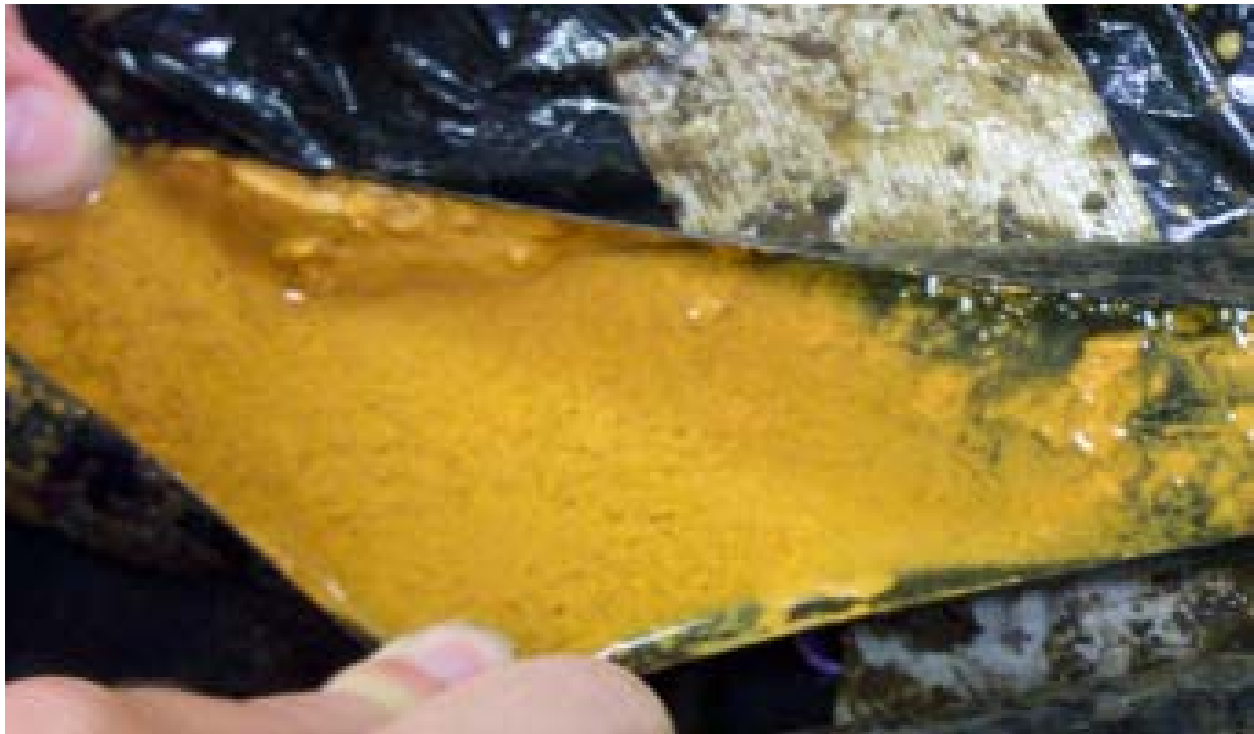
Figure 2: Cut-away of case study field dripline showing precipitant accumulation.

During the winter and early spring of 2002/2003, the producers made contact with K-State Research and Extension personnel. Up until this time, the only operational and maintenance recommendations produced by the designer/installer had been to periodically flush the system. During the initial telephone contacts, verbal generalized information on dripline maintenance procedures, including flushing, chlorination and acidification was provided. SDI bulletins were mailed to the producer. The producer also agreed to have a water quality analysis completed and also removed sample sections of dripline from the visually stressed and non-stressed portions of the field. A cut-away section of the dripline is shown in Figure 2; an orange/yellow paste essentially coated the inner walls of the dripline. The material had slugged off during the handling of the dripline.