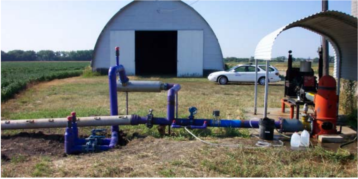
Figure 3b. Improved pumping plant and filtration configuration of the case study SDI system.