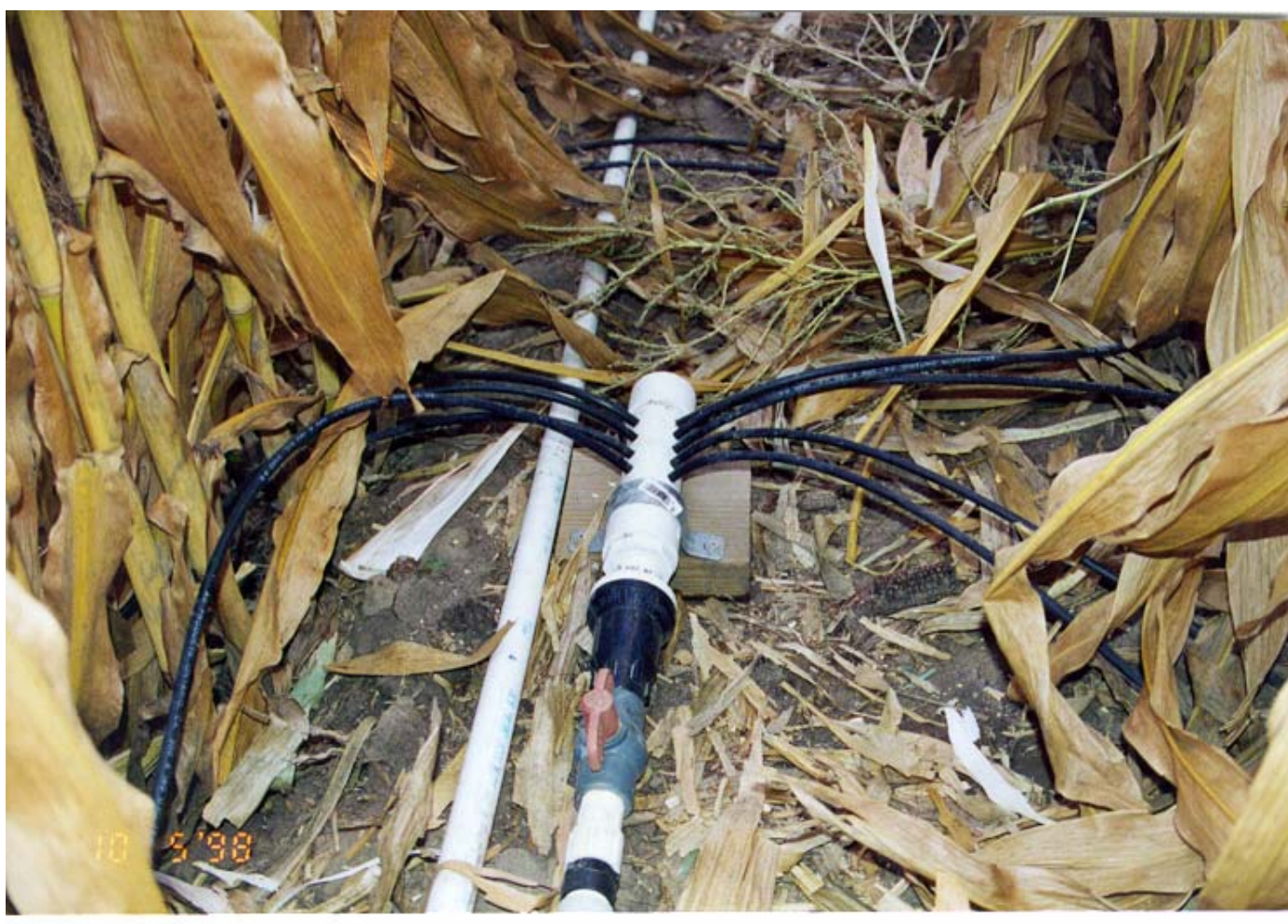
Figure 2. Flow divider used to supply water to 9 individual furrow basins for the purpose of simulating LEPA sprinkler irrigation.

The SDI system was disconnected for the plots associated LEPA treatments during the season to prevent any water application by SDI. The simulated LEPA treatments were accomplished by setting up a surface PVC pipe down the 81 ft length with pressure regulated flow dividers for each 30 ft increment. Each flow divider (Figure 2) had 9 equal length supply tubes (0.25 inches ID) delivering water to 9 individual furrow basins. Furrow basins were approximately 9 ft in length and were constructed in the furrows. The amount of water necessary to apply the one-inch application to the LEPA plots was calculated from the number of flow dividers and supply tubes in relation to the land area covered (3 flow dividers with 9 tubes each covering 81 ft of plots and 15 ft of width [3 furrow basins]). The application rate of the simulated LEPA irrigation treatments was approximately 1.5 in/hour which would nearly match the application rate of typical LEPA irrigation in the region. Furrow basins were used to retain applied water until it could infiltrate into the soil. Furrow basins are an integral part of the LEPA system and practices.