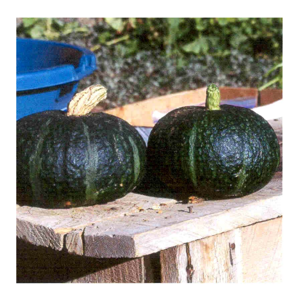
Figure 2: Kabocha squash on the left is mature (the stalk is shriveled and dry). The squash on the right is immature and would be considered non-marketable. The peduncle is still green.

Squash were harvested in the first week of September in 1998 and the second week of September for 1999. Harvest was not possible in 2000 due to the loss of irrigation water at the end of August. Squash were individually weighed and evaluated as marketable or non-marketable. Squash were considered non-marketable, based on the following criteria: 1) sunburn, 2) excessive scarring (scarring would include raised warts and ridges on squash surface), 3) too small (<2lbs), and 3) immature (immaturity was based on the greenness of the stalk (Figure 3). The Brix level (percentage of soluble solids which consist mostly of sugars) was taken from three squash randomly selected from each plot. The Brix levels were taken with a hand held refractometer (Atago Co., LTD., Tokyo, Japan).