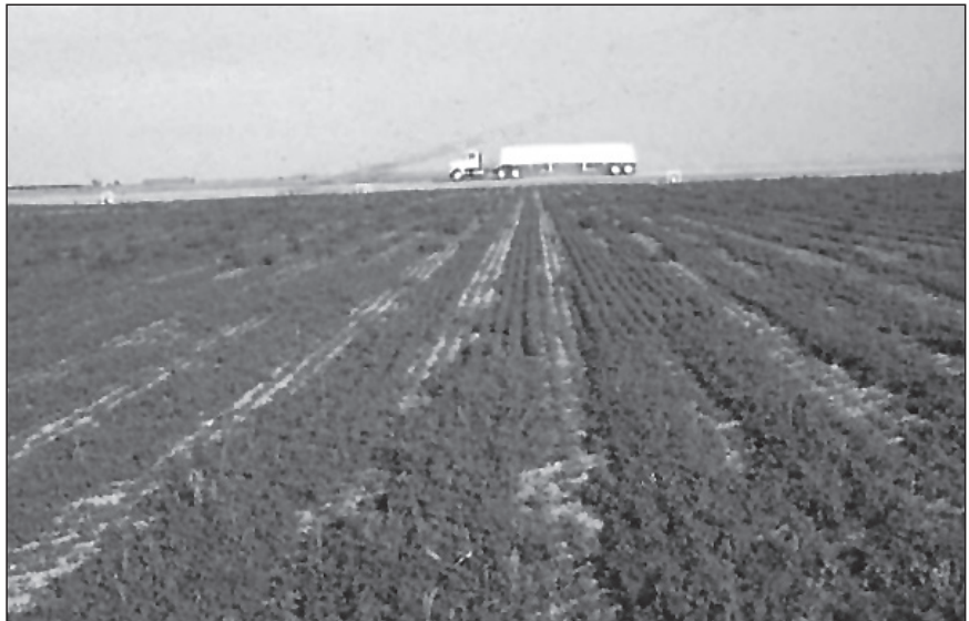
Figures 3a and 3b. The top picture shows alfalfa germination in a 60-inch spaced dripline plot. The bottom picture shows alfalfa germination in a 40-inch spaced dripline plot.