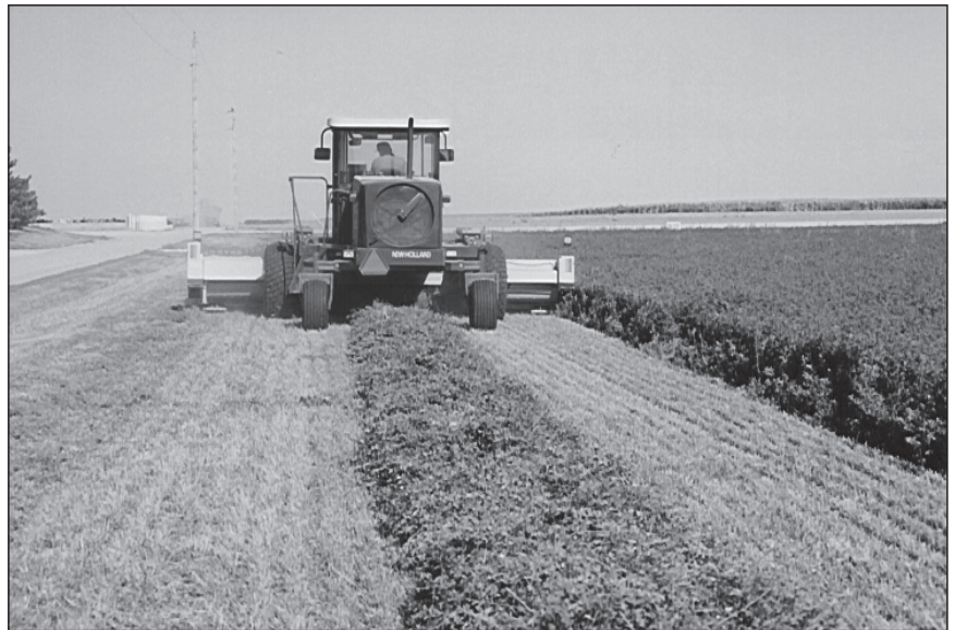
Figures 1a and 1b. The top picture shows a field irrigated by center pivot sprinkler; the bottom picture is a field irrigated by SDI (subsurface drip irrigation). The fields were planted at the same time in the fall.