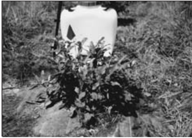
Figure 2. A five-year-old oak seedling less than two feet tall due to heavy deer browsing.

plastic tubular tree shelters, 4 to 5 feet tall (Figure 3) to prevent browsing and rubbing. These have the added benefit of increasing early height growth and making mowing and herbicide applications easier because seedlings are easily located and protected from herbicide drift. A number of commercial and homemade deer repellents have shown variable, limited success.