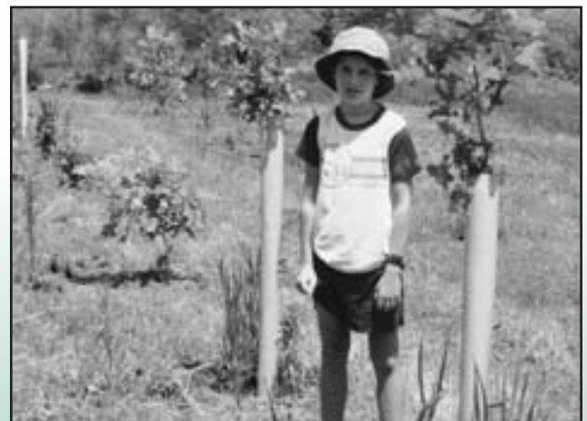
Figure 3. Bur oak seedlings beginning their second growing season, already emerging from four-foot shelters. Note the shorter, unsheltered trees in the background.

For further help establishing a riparian buffer, contact your local National Resources Conservation Service (NRCS) office or Kansas Forest Service district forester.