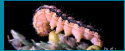
4. Corn Earworm Heliothis zea (Boddie)