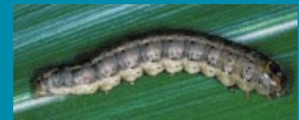
2. Army Cutworm Euxoa auxiliaris (Grote)