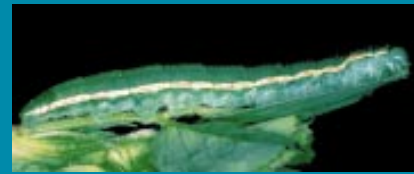
1. Alfalfa Caterpillar Colias eurytheme (Boisduval)