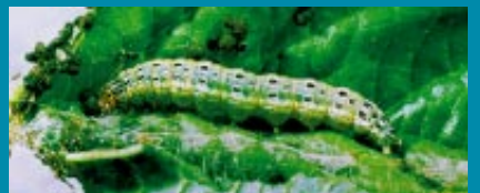
10. Webworm Several species