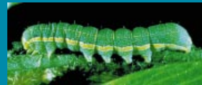
3. Beet Armyworm Spodoptera exigua (Hubner)