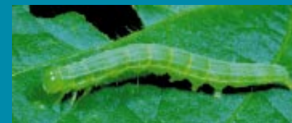
7. Green Cloverworm Plathypena scabra (Fabricus)