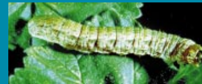
5. Dingy Cutworm Feltia ducens (Walker)