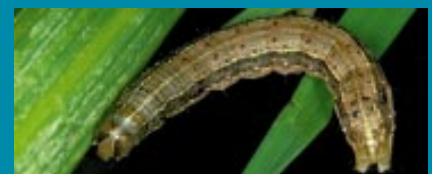
6. Fall Armyworm Spodoptera frugiperda (J.E. Smith)