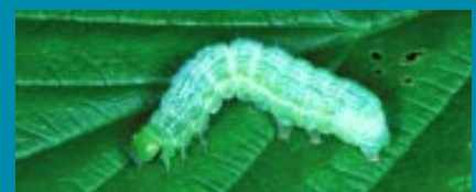
8. Looper Several species