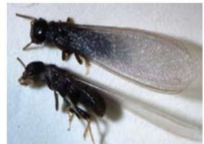
Figure 4 - Reproductives

These fragile wings break off, usually after a short, fluttery flight, leaving the transparent wings or their remnants behind. As a result, swarms of winged termites may have a number of individuals that no longer have wings. Swarmers are most often discovered by homeowners during early spring (infrequently late fall) in Kansas. Swarming is usually initiated by the first warm spring rains.