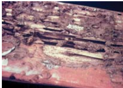
Figure 5 – Mud-filled joints in wood