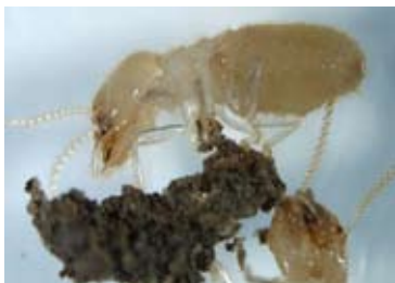
Figure 2 - Worker

Winged termites are commonly mistaken for winged ants. It is easy to distinguish between the two (Figure 1). Winged termites or “swarmers” have straight antennae, thick “waists,” and four long, fragile wings of equal size. Winged ants have elbowed (bent) antennae, narrow waists and two forewings that are larger than the two rear wings.