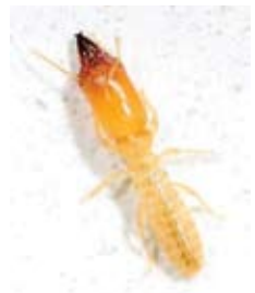
Figure 3 - Soldier

Workers are creamy-white, soft-bodied, wingless, eyeless insects and are most numerous in the colony (Figure 2). They do all of the “work” such as getting food, feeding soldiers and reproductives, building tunnels, etc. Workers feed on the soft grain of the wood, which may result in structural damage.