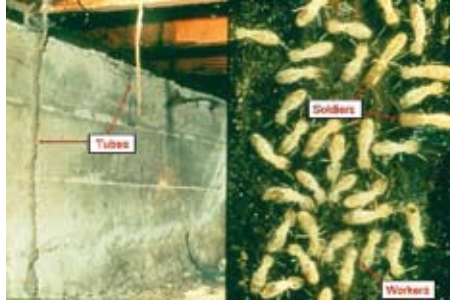
Figure 5 – Termites and Termite Tubes