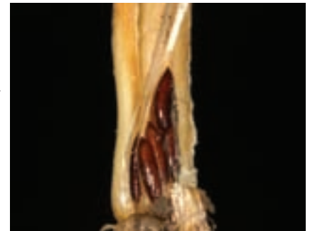
Figure 4. Puparia

Fall infestations are not always conspicuous at first. Infested shoots are stunted and sometimes killed. The entire stand may be lost, especially if significant infestation occurs shortly after germination while plants are in the seedling stage. If tillering has begun at the time of infestation, only individual tillers may actually be killed. Examination of an infested tiller usually reveals an undeveloped central shoot with an unusually broad and thickened, bluish-green leaf. To confirm the diagnosis, carefully remove the plant and roots from the soil. Look closely for maggots or flaxseeds by gently pulling the leaf sheath away from the stem and inspecting all the way down to the base of the plant.