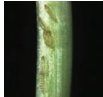
Figure 3. Larvae

Within three to 10 days, the oblong reddish eggs hatch into tiny larvae that migrate downward during the night when humidity is high. Larvae cannot survive exposed on the leaf surface. They move down the plant between the sheath and stem stopping just above the crown, generally just below the soil surface. Larvae feed by withdrawing sap from the plant for eight to 30 days. Temperature influences development, and most larvae mature before the onset of cold weather.