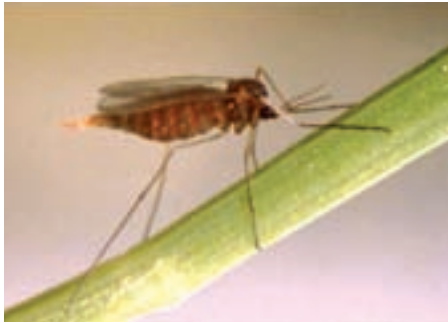
Figure 1. Adult

Infestations were lower from the 1970s to the 1990s, but have increased in recent years. Localized areas of economic damage occur in Kansas almost every year.