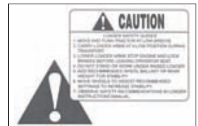
Figure 1. Typical safety sign for front-end loaders.