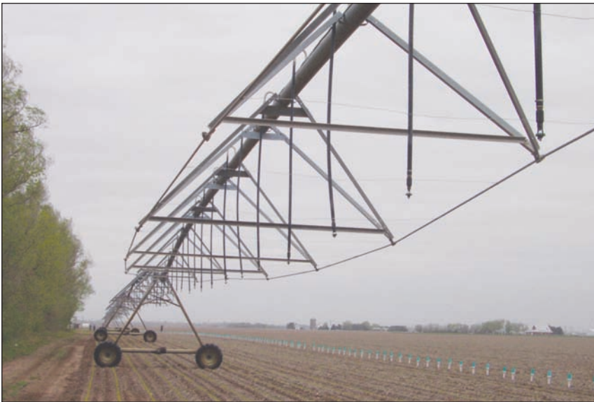
Figure 3: Center pivot equipped with moving plate nozzles mounted near truss height.