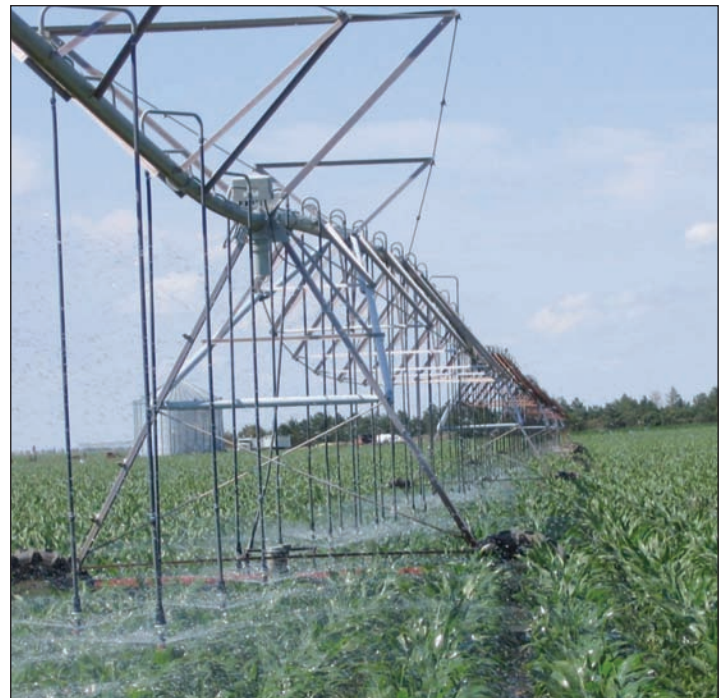
Figure 5: Center pivot equipped with fixed plate nozzles with pressure regulators mounted on drop nozzles at a low height.