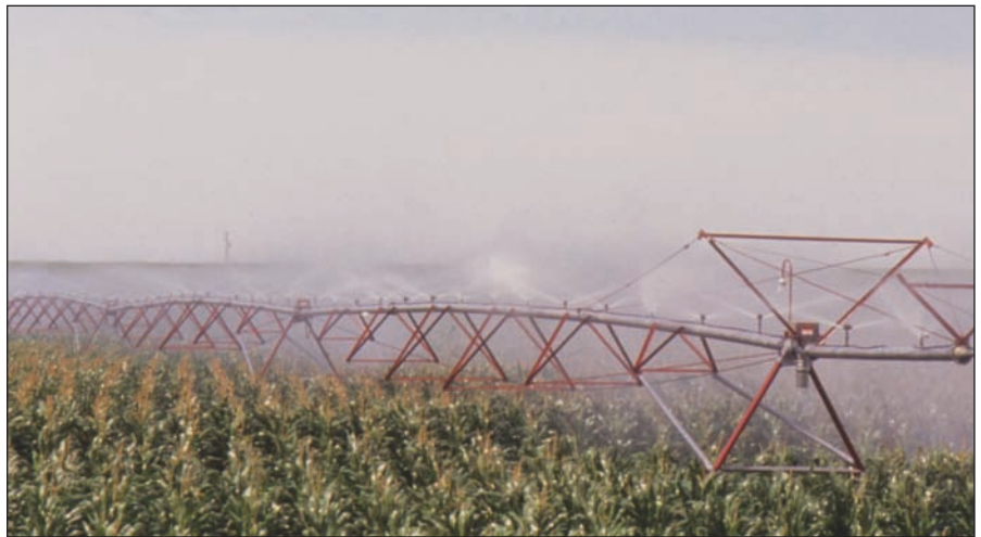
Figure 2: Center pivot equipped with impact sprinklers.

The observations of primary interest for this region were the number of end guns used on the center pivot systems. Table 1g reveals that more than one-third (37.5 percent) of the systems were equipped with a big gun, or traditional end gun, which requires a booster pump. On the other hand, 48.9 percent of the systems were equipped with either double or single large impact sprinklers, which are pressurized by using existing system pressure. Almost 13 percent of the systems did not have a different nozzle at the outer end as compared to the rest of the center pivot system.