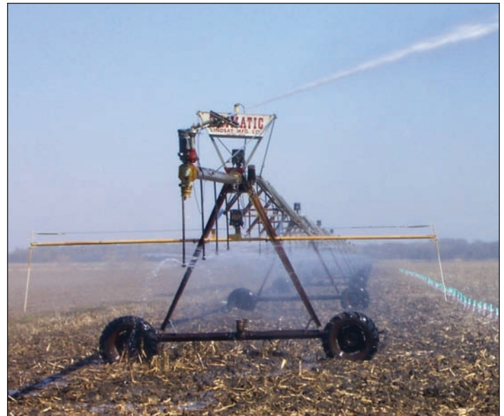
Figure 4: Center pivot equipped with moving plate nozzles mounted near truss height and end gun.