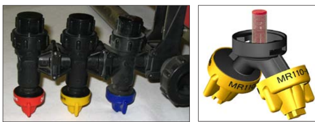
Figure 3. Wilger combination nozzle bank (left) and Twin Cap adapter with MR nozzles.