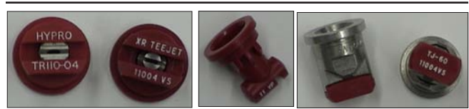
Figure 1. Total Range, Extended Range (left), Turbo TeeJet flat-fan (center), TwinJet (right)