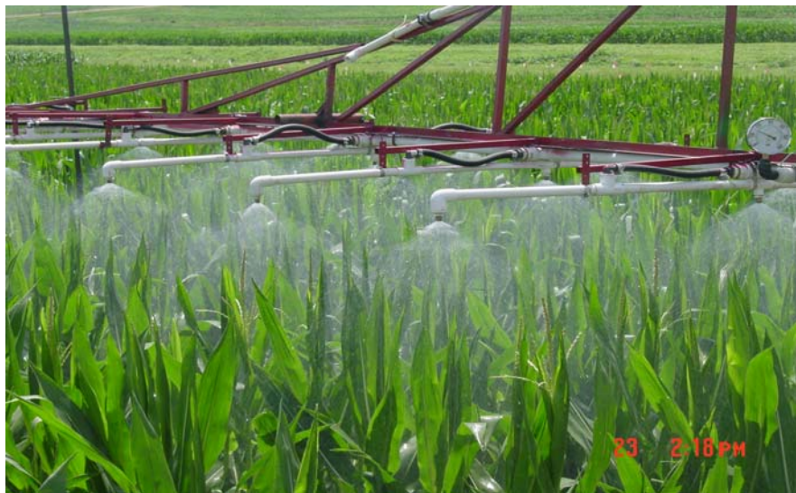
Figure 2. Applicator used to apply liquid swine manure to corn and soybean.

growth stages of corn and soybean. The first application was applied on July 2 when corn was at the V7 growth stage and soybean was in the V3 stage (Ritchie, et al., 1996; Ritchie and Hanway, 1984). Air temperatures during application were in the upper 80's. The second application was applied on July 24 when corn was at the V14 stage and soybean was at the R1 stage. Air temperatures during application were again in the upper 80's. Approximately 0.5 inches of liquid manure was applied over a 10-minute period to corn and soybeans at each EC level.