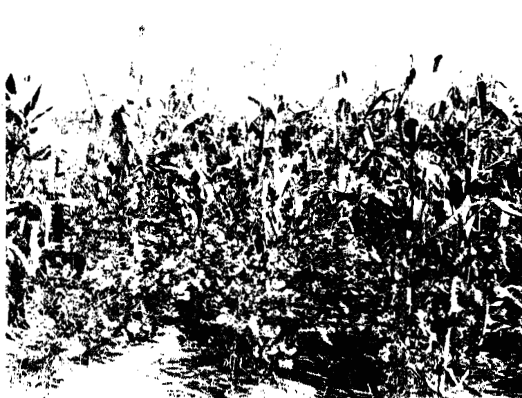
Fig. 6.—Soybeans in corn for silage or pasturing off.

Planting soybeans with corn for pasturing or hogging off is practiced extensively in some sections. (Fig. 6.) This com-