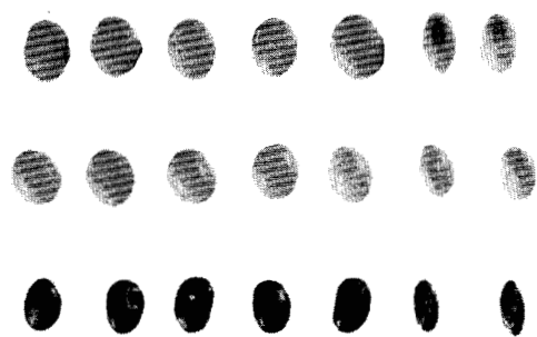
Fig. 4.—Seed of different soybean varieties differ in size. Top, A. K.; center, Hongkong; lower, Laredo.

Poor stands frequently result from planting too deeply. A depth of 1 to 1½ inches usually is sufficient; and only on sandy soil should the depth exceed 2 inches. The rate of planting varies somewhat with the kind of soil, and especially with the size of seed. Small, seeded varieties, such as Peking and Laredo,