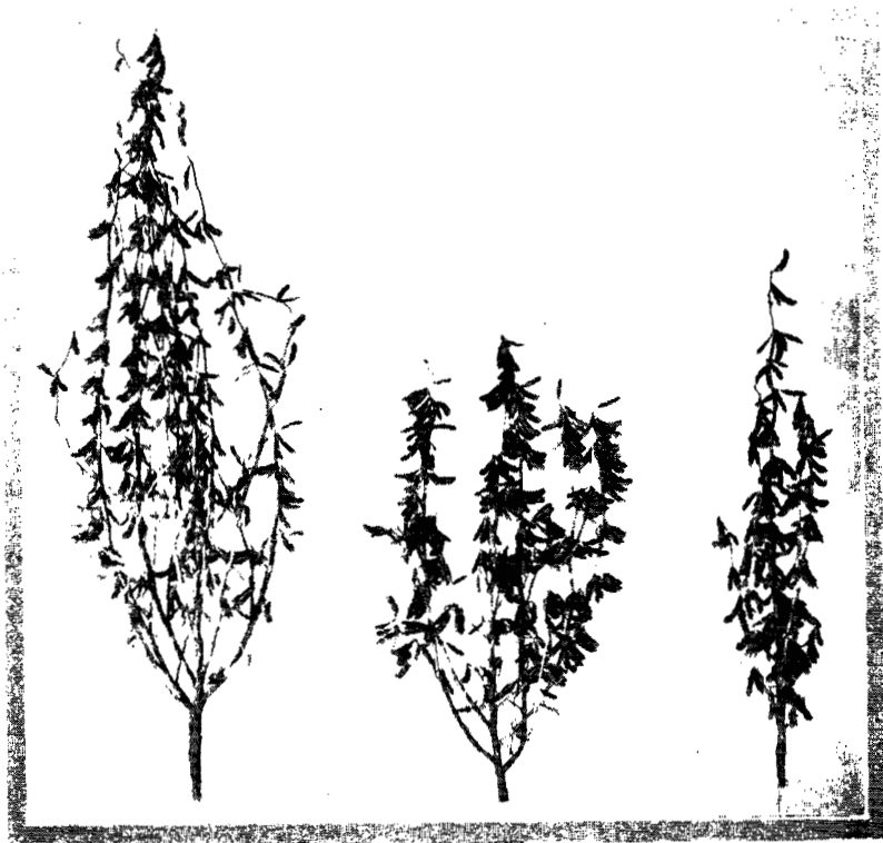
Fig. 2.—Typical plants of three good seed-producing varieties.

Soybeans are an excellent crop to plow under for green manure. In experiments at the Michigan and at the Connecticut Agricultural Experiment Stations they compared favorably with cowpeas and with clover for this purpose. The Arkansas Agricultural Experiment Station secured an increase in yield of corn of approximately 45 percent from plowing under a crop of soybeans. Similarly the Mississippi Agricultural Experiment Station reports an increase of 48 percent in the yield of cotton following a soybean crop used as green manure. Generally