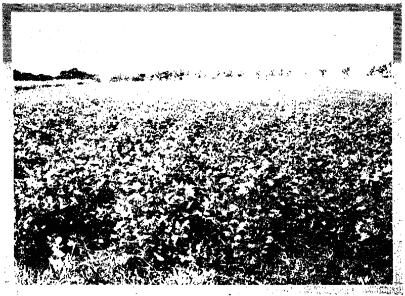
Fig. 1.—A field of soybeans in 38-inch rows on the Agronomy Farm at Manhattan.

The increased interest in the crop is due largely to the constant need for protein feed on the farm and the high cost of protein concentrates. The difficulties in maintaining a normal acreage of alfalfa have directed attention to the soybean as a