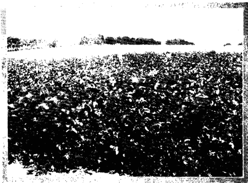
Fig. 5.—A good hay crop of Virginia soybeans.

The hay crop is ordinarily cut with a mower, although the binder is sometimes used. Hay cut with a mower is handled in about the same manner as alfalfa. Usually it is left in the swath until thoroughly wilted and then raked into light windrows before the leaves become dry enough to shatter. It may be left