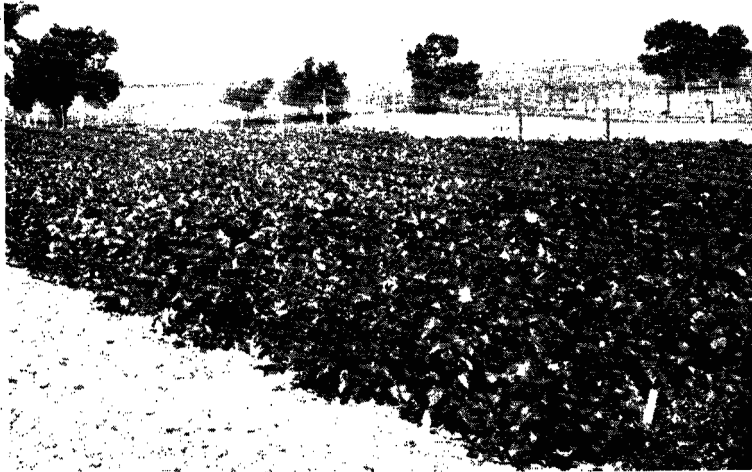
Fig. 7.—Varieties of soybeans grown for comparative yields of hay and seed.

Success with soybeans depends largely upon choosing a variety which is adapted to the locality and suited to the purpose