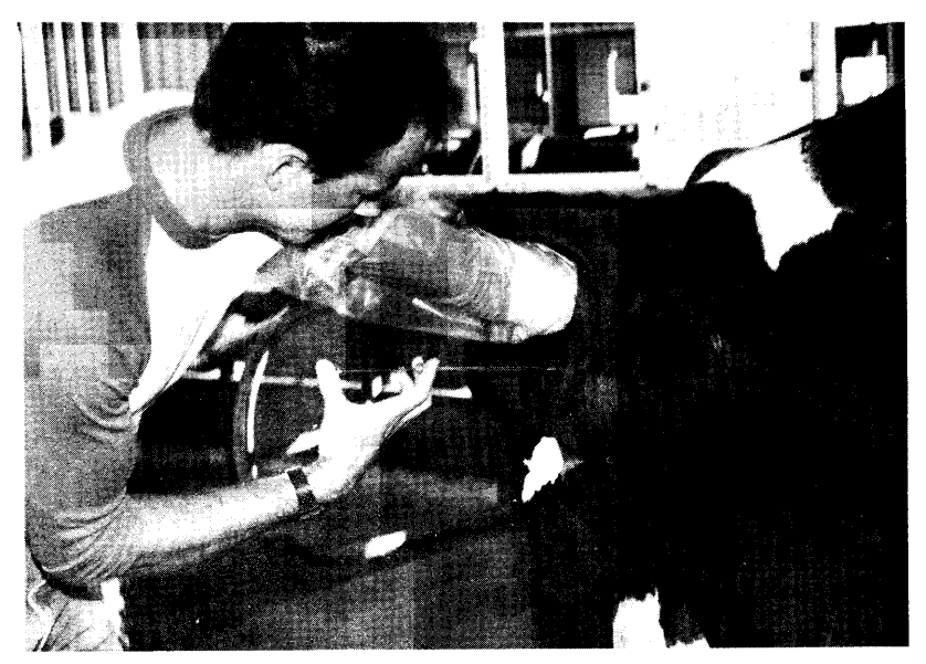
FIGURE 4. Strict sanitation procedures and correct semen placement are necessary to obtain satisfactory results with AI.