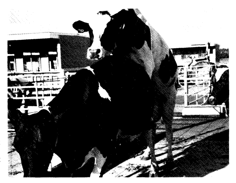
Figure 1. Heat detection is the main management problem in the Al program. A heat expectancy chart will increase the number of animals detected in heat along with recognizing the subtle signs of heat.

Since pregnancy rates to first service should be 50-60 percent, anticipating "repeats" increases the accuracy of heat detection by looking for subtle signs of heat such as: