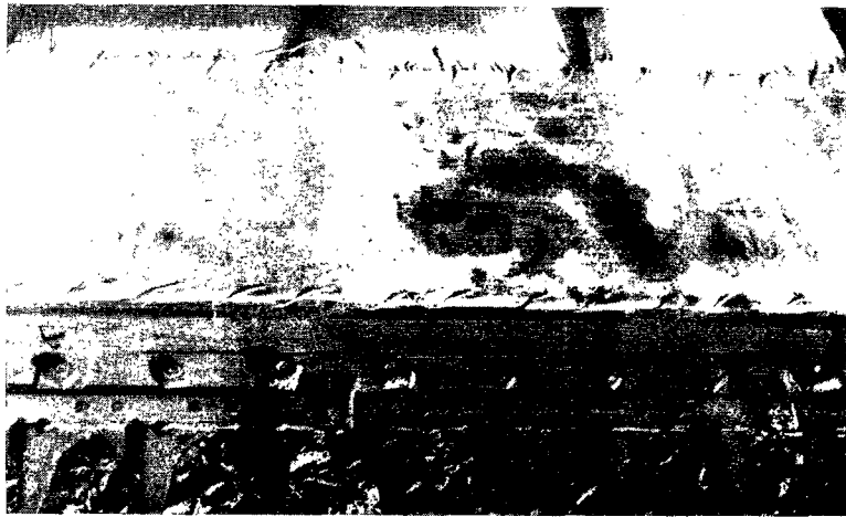
Fig. 2.—A portion of the platform canvas of a binder prepared for cutting flax by having a strip of canvas sewed on the front side.

Grain binders are available in practically all communities and are satisfactory machines for harvesting flax. The packers of the binder may cause some shattering if the flax is over-ripe. Many flax growers do not use twine in the binder but let the flax fall from the machine in bunches