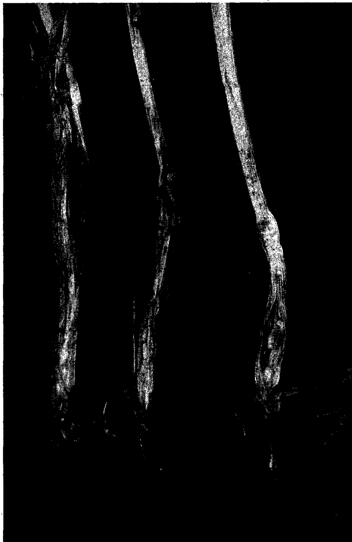
FIG. 2.—Wheat plants heavily infested with larvae and flaxseed of the Hessian fly. (After McCulloch).

brood. (Fig. 1.) These may be supplemented by late spring, mid-summer, and late fall broods of varying size. The main periods of active development of the fly, however, are in spring and fall, and development is favored by abundant moisture and moderate temperature. Summer and winter periods are passed inside the plant sheaths in the puparium, or "flaxseed" stage. (Fig. 2.)