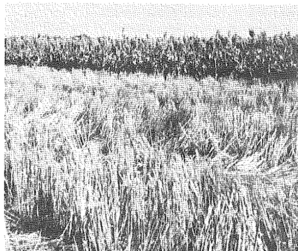
Fig. 2. Research plots at Tribune Branch Experiment Station showing weed-free wheat stubble after herbicide was applied, with grain sorghum in the background grown after wheat with the same herbicide treatment, 1973.

other items such as interest must also be considered. Gross returns can be easily calculated from yields given in Table 2. Use current or expected commodity prices. In any event and with virtually any realistic price structure, it seems that FWS+ (1768 lb grain/a/yr) will net substantially more per acre than will FW (990 lb/a/yr).