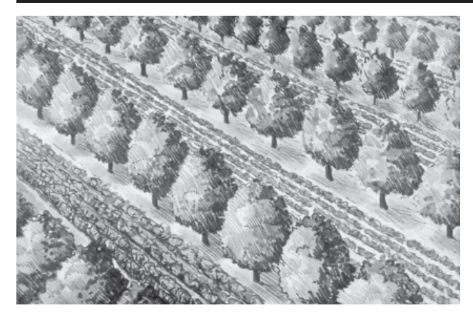
Figure 1. Schematic of alley cropping.