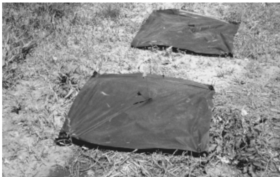
Figure 2. Example of using plastic weed barriers around individual trees. In this example, the barrier has been cut in a 4 by 4 ft square, with a slit cut in the middle for planting the tree.

Application of synthetic weed barriers may be a desirable and practical management tool for establishing tree stands in the Great Plains. They provide an effective and economical alternative to herbicides and cultivation. Problems with girdling are not likely, but follow up is needed and appropriate measures should be taken if the mulches appear to be restraining diameter growth of the trees.