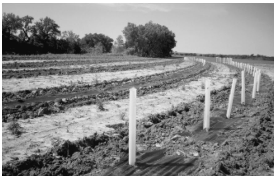
Figure 3. In this example, the weed barrier has been placed in strips, with trees planted in slits cut out of the center of the strip. Soil is tossed over the barrier at intervals to help hold it in place.