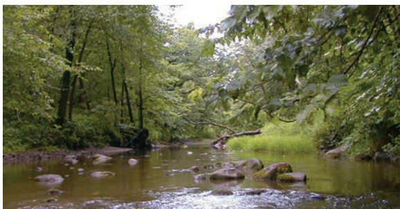
Figure 3. Natural woody vegetation should be left to protect streambanks.

These results show that woody vegetation is highly effective for protecting streambanks. Standing trees slow water movement, thus reducing the energy available for erosion and allowing deposition of suspended materials. Greater rooting depth, larger and stronger roots, and perhaps greater rooting density also stabilize the soil mantle.