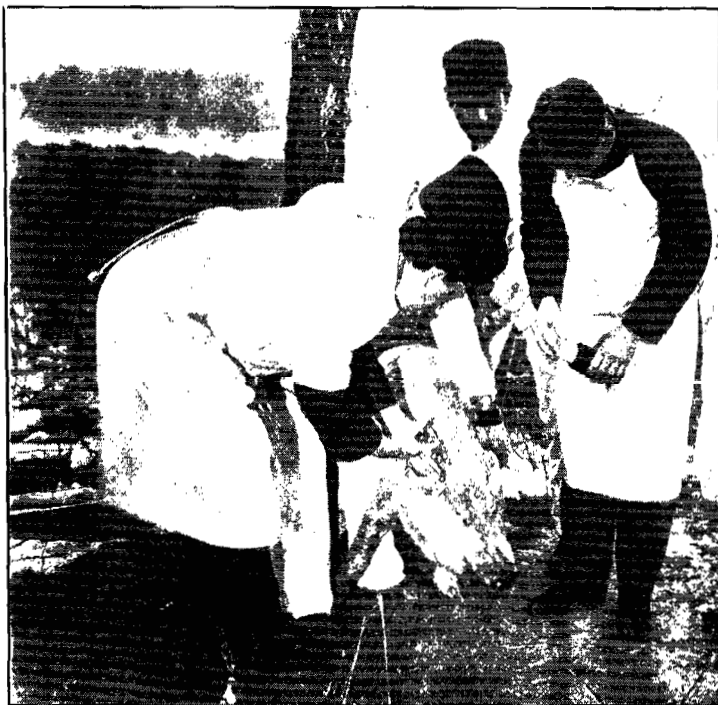
FIG. XI. Method of vaccinating a sow heavy in pig.

public stockyards infected with cholera. Persons walking from these public yards to the depot platforms naturally infect these places. It is in this way that a crated breeding hog, for instance, shipped by freight or express, becomes exposed to the disease and may infect the whole premises when released from the crate. It is therefore not safe to take a hog upon the public highway even, especially if there has been cholera anywhere in the vicinity. In the fall of the year, during severe dust storms, the germs may be blown a considerable distance with infected straw, weeds, etc.