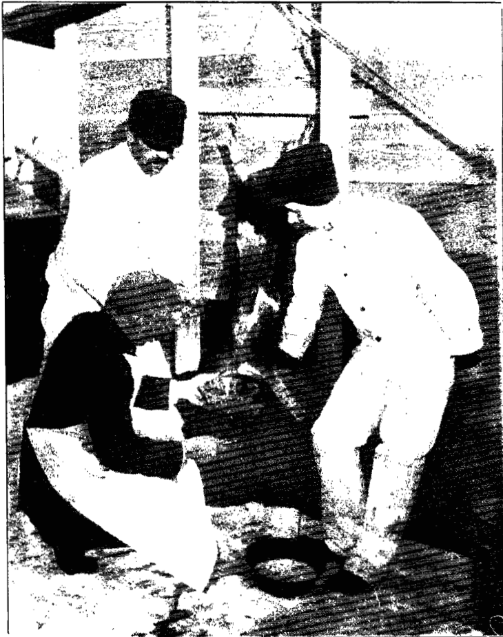
FIG. XII. Bleeding a pig about to die with the cholera. The defibrinated blood will be used either for hyperimmunizing or for vaccinating healthy hogs.

animal. If a person has any sore on his hand he should not touch a dead animal, or if he should receive a cut or scratch during the examination the hand should be placed in pure kerosene at once, the sore well filled and the bandage saturated with it.