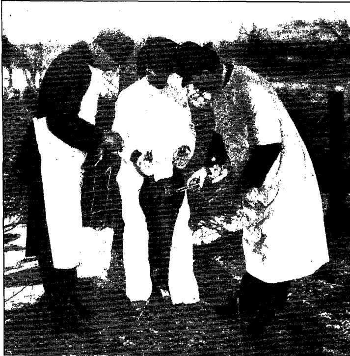
FIG. VIII. An easy way of vaccinating a light shote.

HOLDING THE HOGS WHILE VACCINATING. The pig up to the 100-pound shote is easiest handled by an attendant holding it up by the hind legs, belly forward and head held between the attendant's legs, as shown in the illustration, figure VIII. Very heavy hogs may be caught by placing a rope around the front leg or snout and held around a tree or post, or may be run into a chute or crate and vaccinated as in figure X.