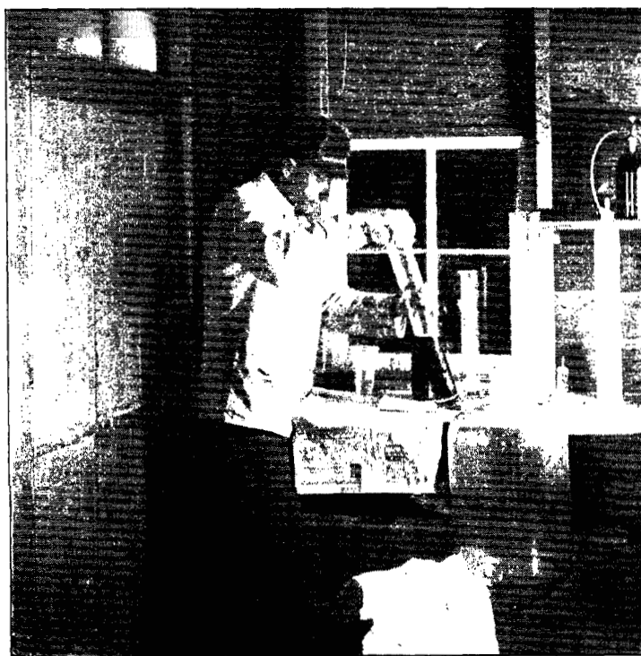
FIG. III. Serum laboratory. Mixing the serum.

1000 cc. of virulent blood. After ten days the hog is ready to produce blood for serum and is bled usually three times more at intervals of seven days, and if the tail holds out he is then rehyperimmunized and again bled two or three times, the same as before. In either case at the last bleeding the hog is killed and all of his blood taken. The serum from all of these drawings is mixed together and its potency tested. If it is potent, it is ready for use. This is necessary as the serum from the last drawing is usually less potent than that from the first drawings, and after it is all mixed together it should be a serum of average potency.