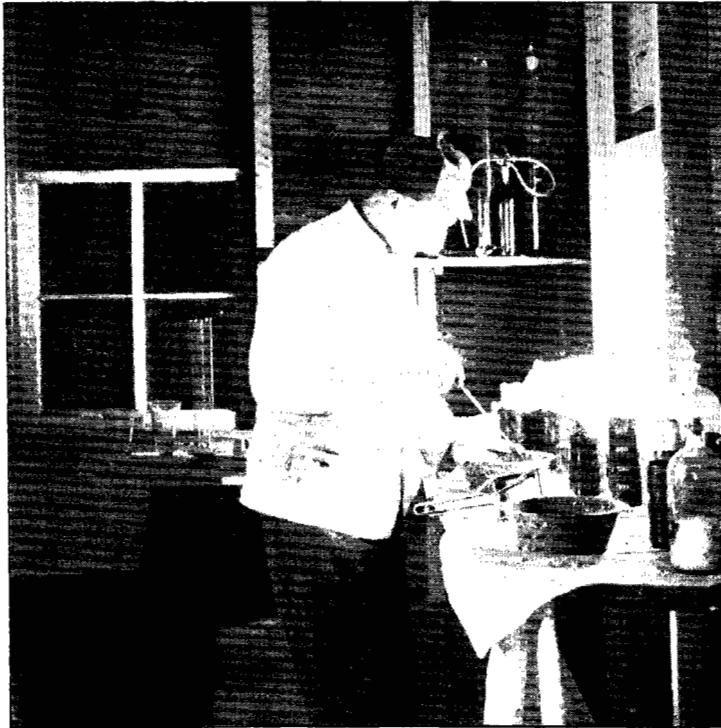
FIG. IV. Defibrinating the virulent blood. Serum laboratory.

At the present time the cost of the serum approximates somewhere in the neighborhood of one and one-half cents per cubic centimeter, at which price it is sold, making the cost per dose for the shote of 100 pounds or less 30 cents for the serum only. As the college has no funds for the production of the serum, it will be necessary to make a charge for it, at least until after the meeting of the next legislature.