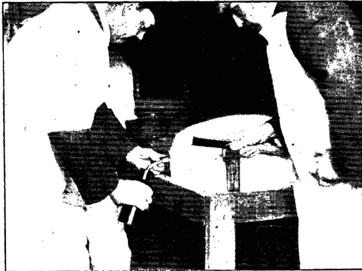
FIG. VII. Method of drawing blood from an hyperimmunized hog. The animal is covered with a clean piece of muslin to prevent dirt from falling into the vessel with the blood.

TREATMENT AFTER VACCINATING. From the fact that there is always more or less fever caused by vaccinating and more or less danger of the animal becoming infected through the wound made by the needle of the syringe, the following after-treatment would suggest itself: Spare diet for three or four days, especially of corn, but plenty of water, thoroughly clean and comfortable pens with plenty of clean bedding, with absolutely no chance to get into mud of any kind. The more mud and dirt the more danger. They should not be dipped or operated upon for at least two weeks after vaccinating.