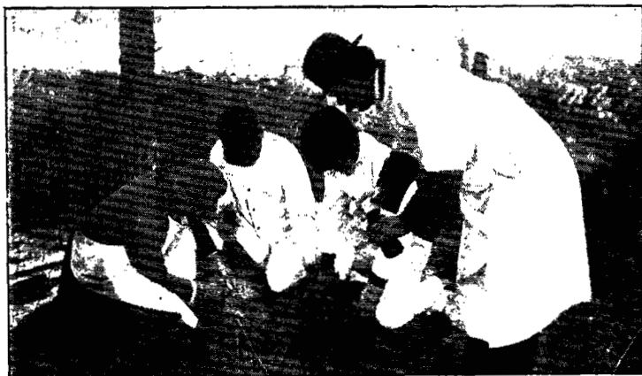
FIG. IX. Vaccinating heavy hogs.

The accumulation of vermin on the animal itself or in the pens. Too exclusive a corn diet. The hog being frequently a scavenger, following the cattle in all kinds of mud, filth and dust, is liable to breathe the germs or irritating dust and the lungs become infected with tuberculosis or other debilitating disease germs. In fact anything that has a tendency to weaken the system of the animal renders him a more fit subject for hog cholera.