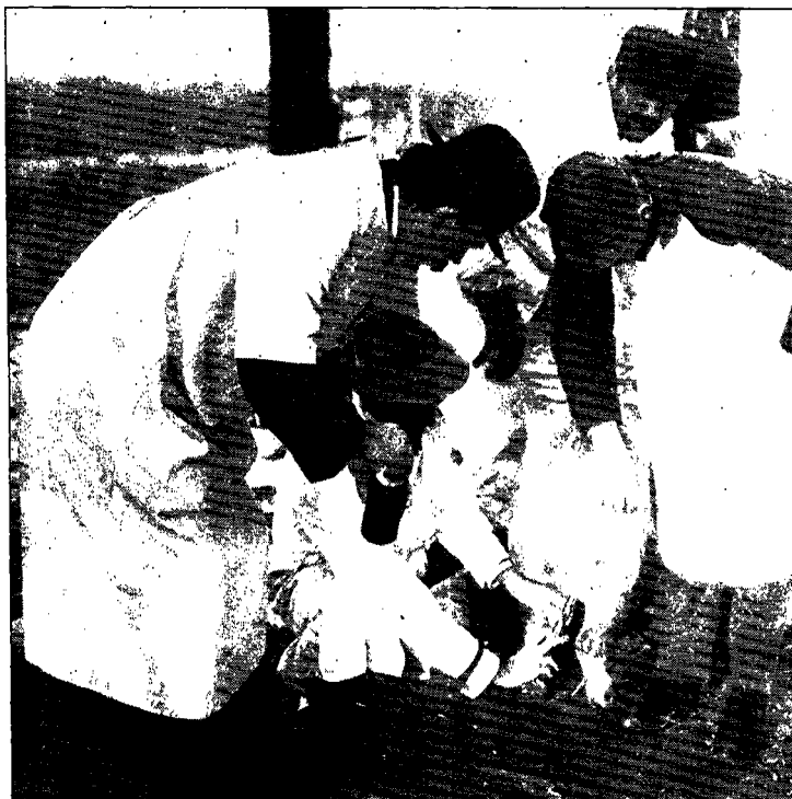
FIG. X. Heavy hog snubbed up close to a post and held for vaccinating.

near the pens of sick hogs; neither should the attendant be allowed to leave the vicinity of the pens without first thoroughly cleaning and disinfecting his shoes or putting on others not infected. Dogs, cats, rats, crows and other birds—in fact, every living thing—should so far as possible be kept away from the infected places.