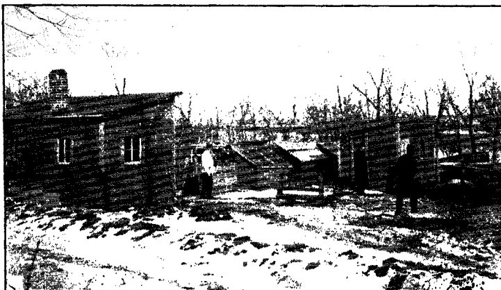
FIG. I. Some of the buildings used in the production of anti-hog cholera serum at the Kansas State Agricultural College.

Before any serum produced at the Kansas State Agricultural College is sent out or used, it must be tested in the same way; it must prove, as the first did, that it will prevent the vaccinated hog from taking the cholera—it must prove potent.