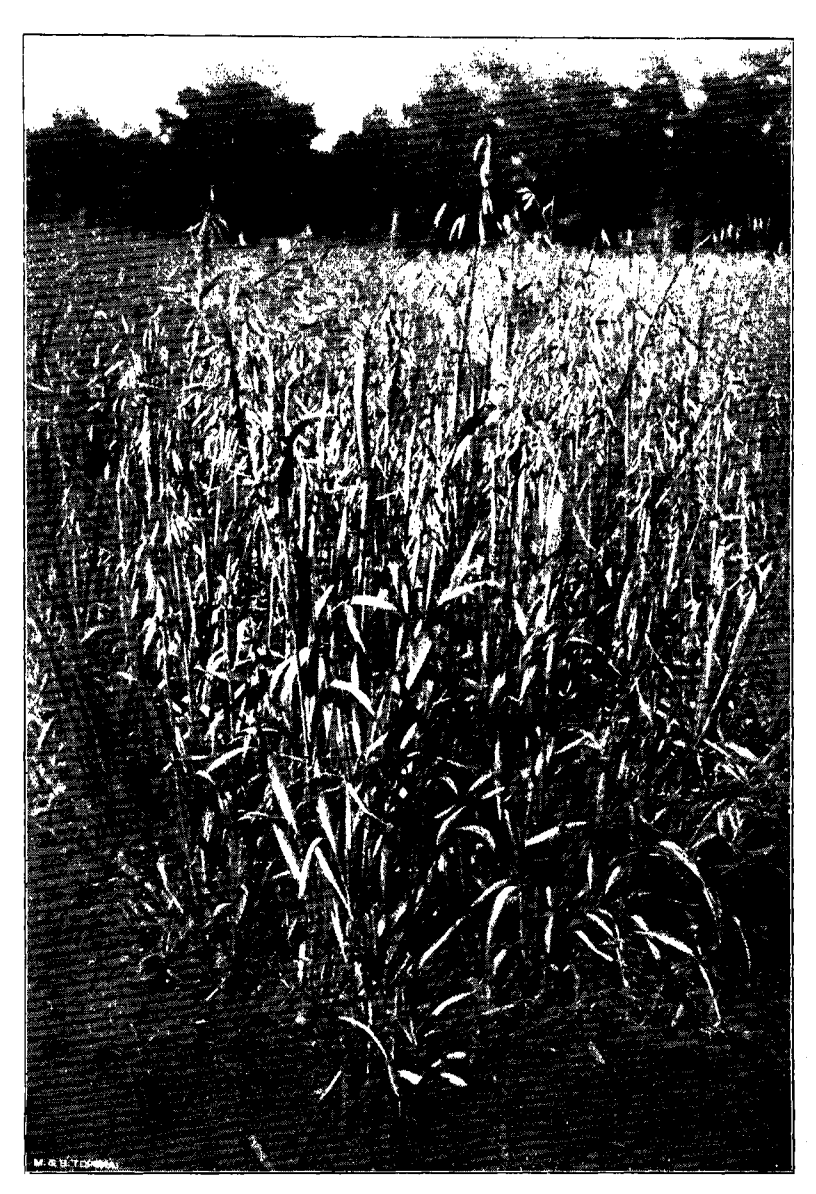
PLATE II. BLACK OATS. Nursery plot, near view.