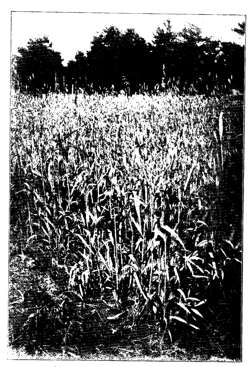
PLATE III. RED OATS. Nursery plot, near view.