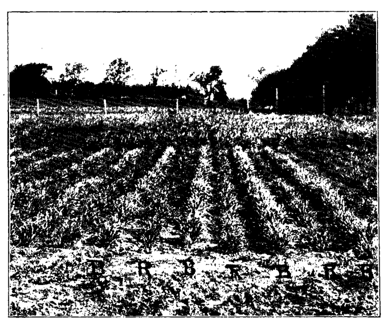
Pure lots of Red and Black Oats, planted in alternate rows, of twenty each.