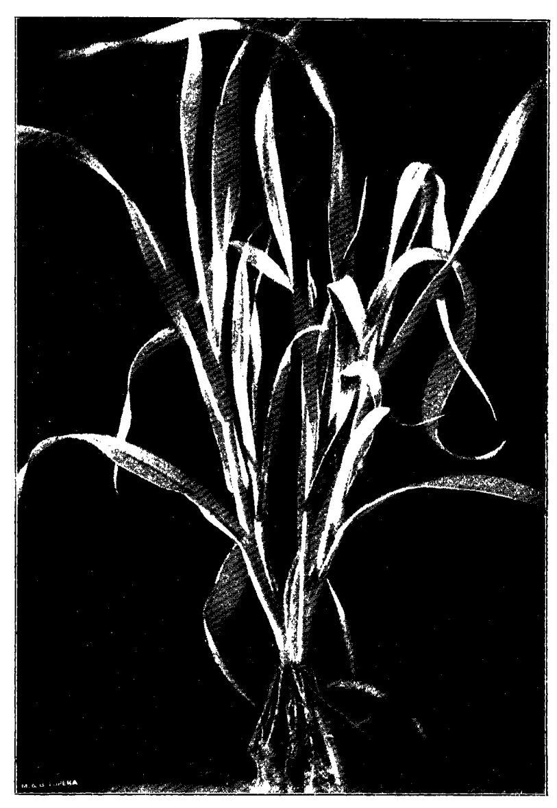
PLATE IV. BLACK OATS. Single plant. Note upright habit of the plant and absence of any "stooling" tendency.