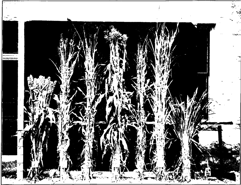
Plate V. —No. 1, Black-hulled White Kafir-corn; No. 2, Kansas Orange cane; No. 3, Early Amber cane; No. 4, Kavanaugh cane; No. 5, Folger cane; No. 6, pencillaria; No. 7, teosinte.