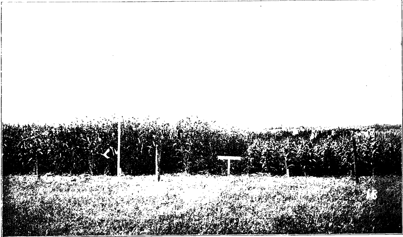
Plate III.—Field trial of varieties of sorghum.