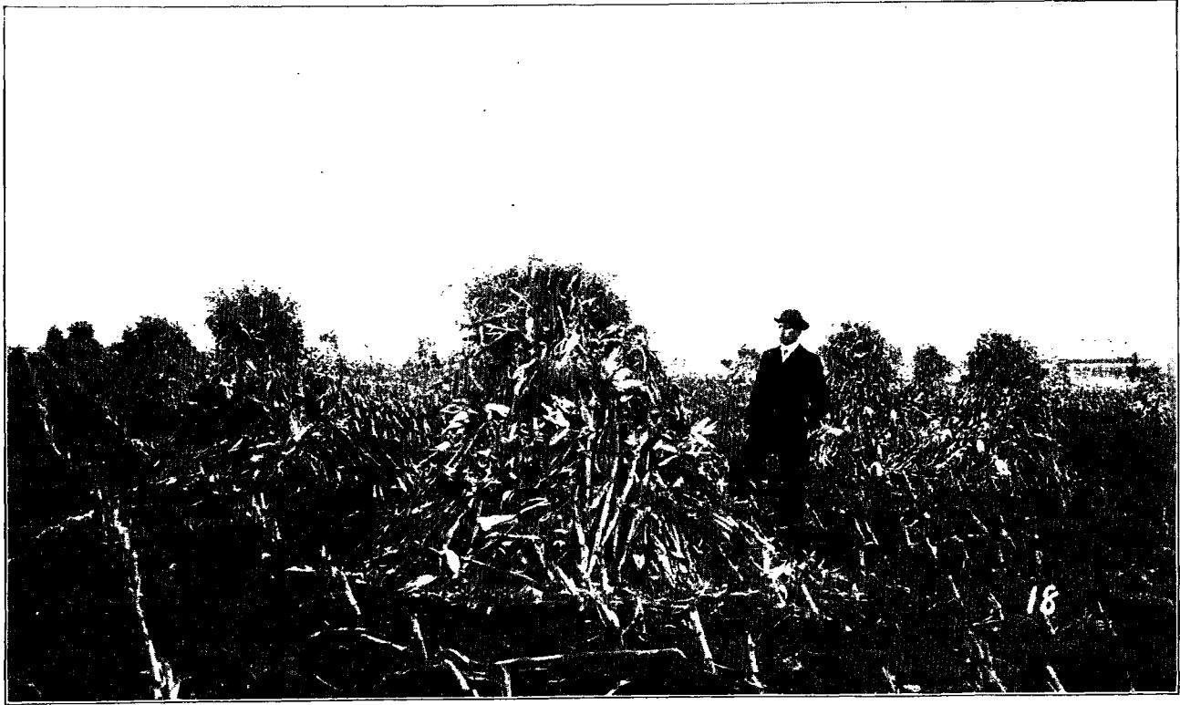
Plate VII. —Twenty-acre field of Reid's Yellow Dent corn. (Yield, 50 bushels per acre.)