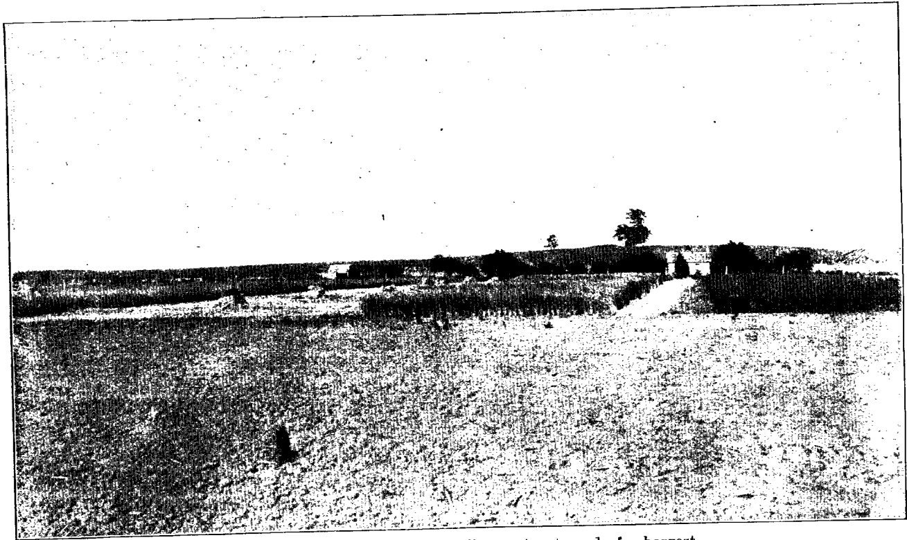
Plate X.—Rotation plots with alleys cut out, ready for harvest.