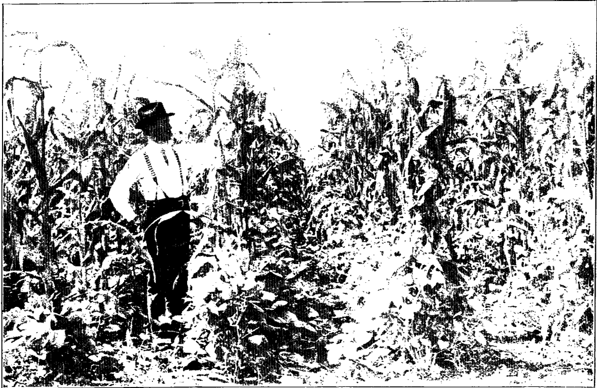
Plate IX.—A field of corn and cowpeas planted together in drill rows.