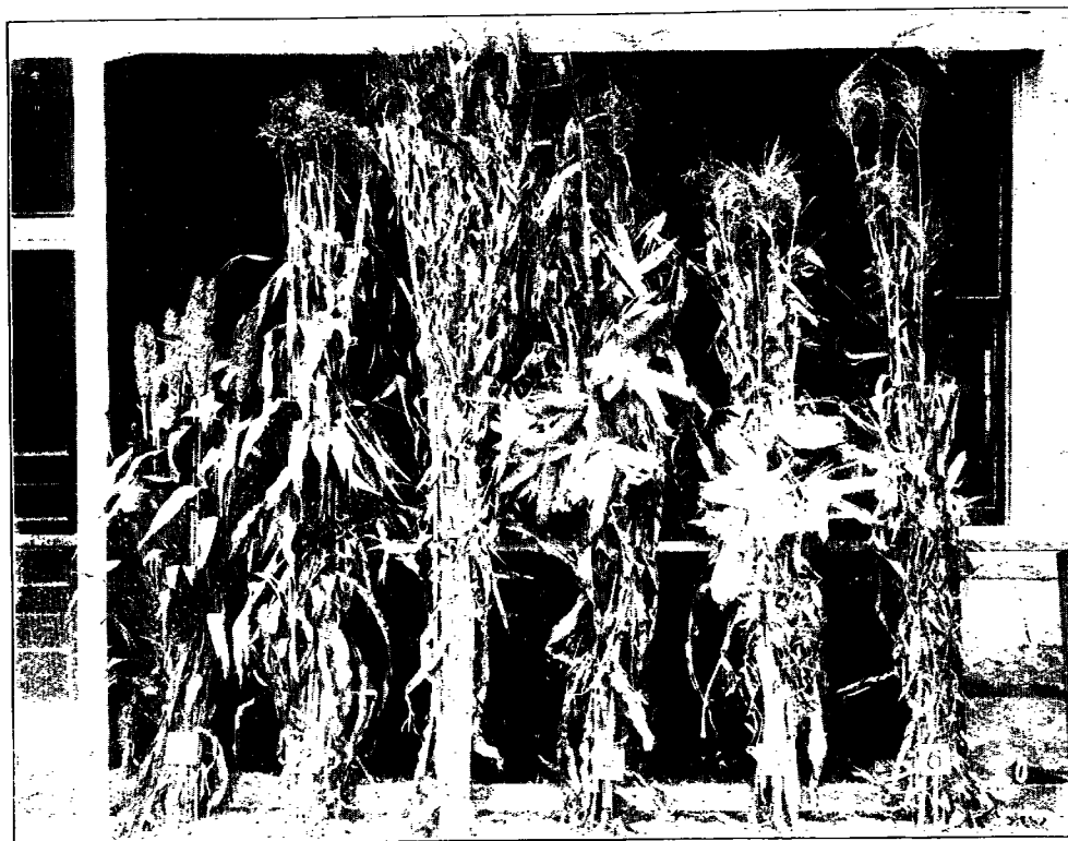
Plate VI. —No. 1, Red Kafir-corn; No. 2, Kavanaugh cane; No. 3, Yellow milo maize; No. 4, Hildreth corn; No. 5, Forsythe's Favorite corn; No. 6, Brazilian Flour corn.