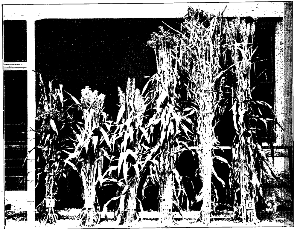
Plate IV. —No. 1, Brown Dounha; No. 2, Black-hulled White Kafir corn; No. 3, Red Kafir-corn; No. 4, Kavanaugh cane; No. 5, Yellow milo maize; No. 6, Large African millet.