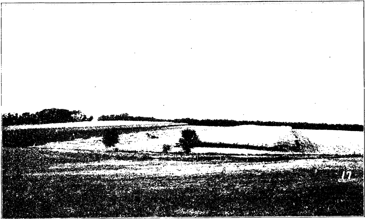
Plate VIII.—Field trial of late forage crops.