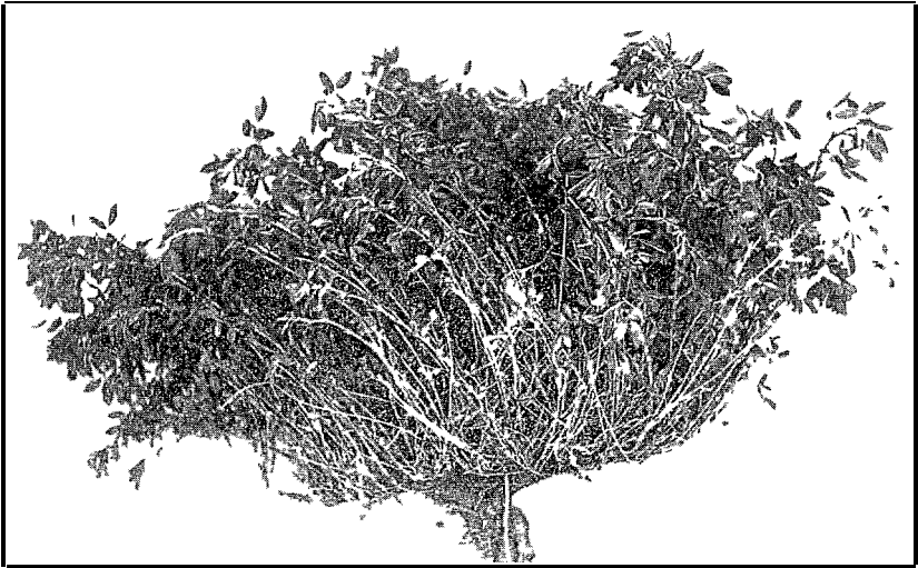
FIG. 2. Alfalfa plant having 312 stalks from one root. Taken May 6; growing in high upland, stiff hard-pan subsoil, 180 feet to water. Plant ten inches high; eight years old.