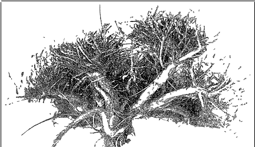
FIG. 3. Crown of plant shown in fig. 2. Stalks removed, to show branching of crown.