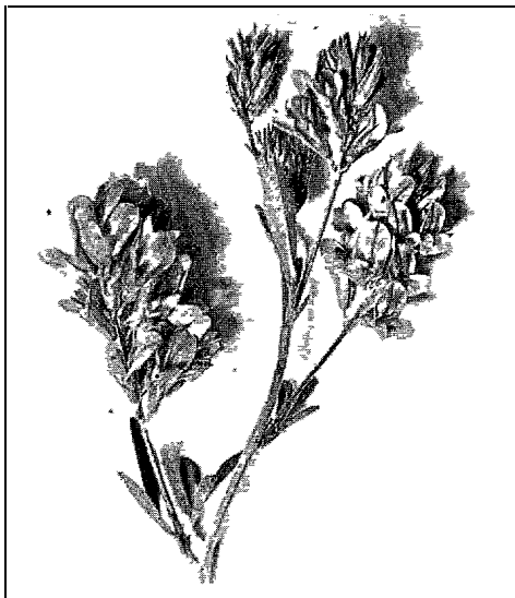
FIG. 6. Alfalfa blossom, enlarged.