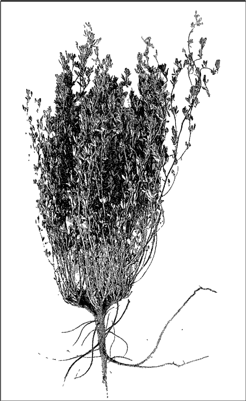
FIG. 1. Alfalfa plant on upland, four years old; seventy stalks from one root. Height of plant, thirty-six inches. Shows effect of disk-harrow in splitting crown. Taken May 28.