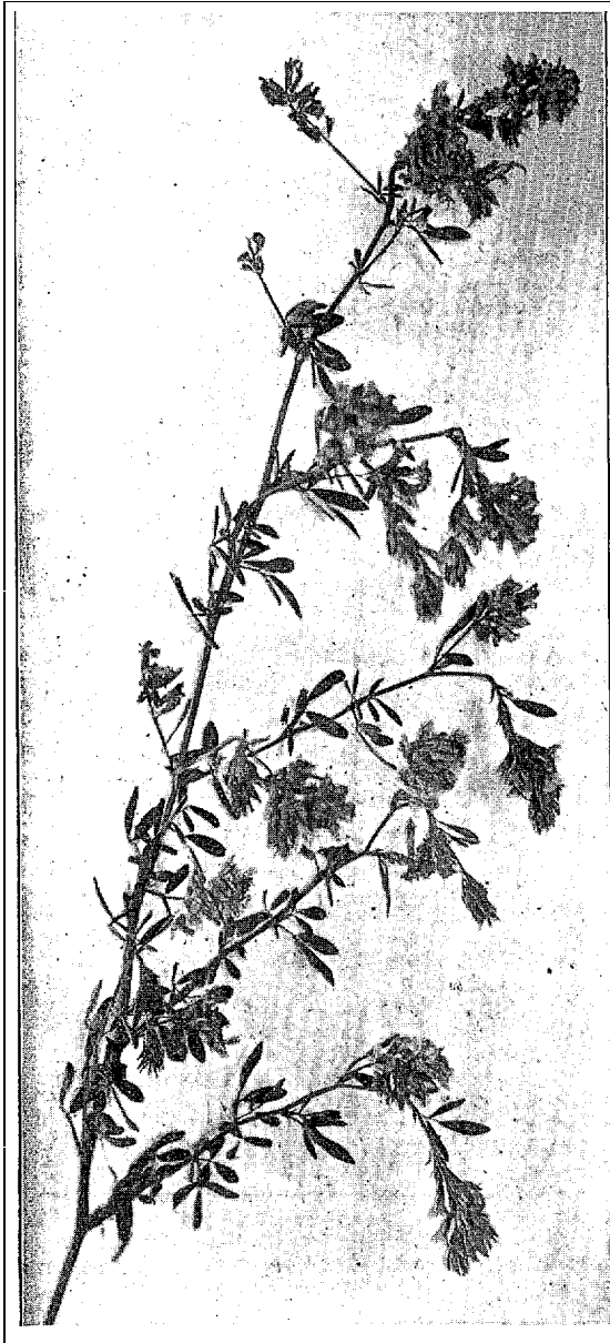
FIG. 7. Alfalfa stem and blossom.