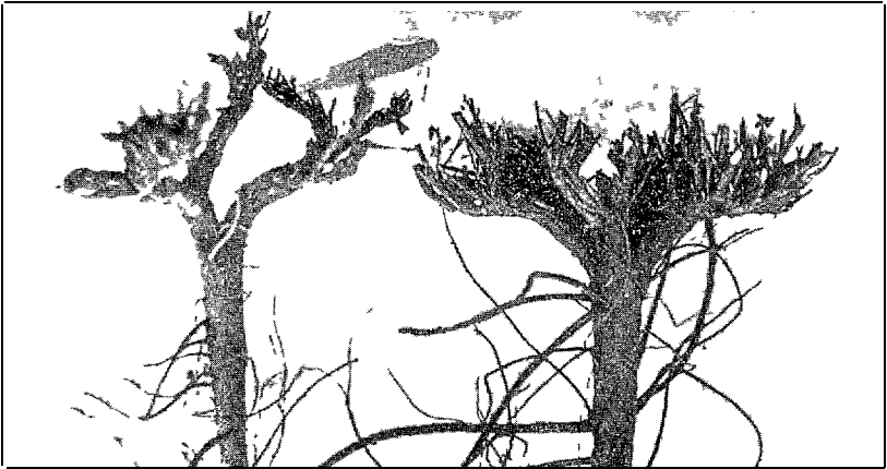
FIG. 5. Alfalfa crown split by the disk-harrow. Roots photographed May 28, 1902. Alfalfa disked four times in 1900, four times in 1901, and once in 1902. Harrowed with smoothing harrow once in 1900 and once in 1901. The root on the right belongs to the plant shown in fig. 1.