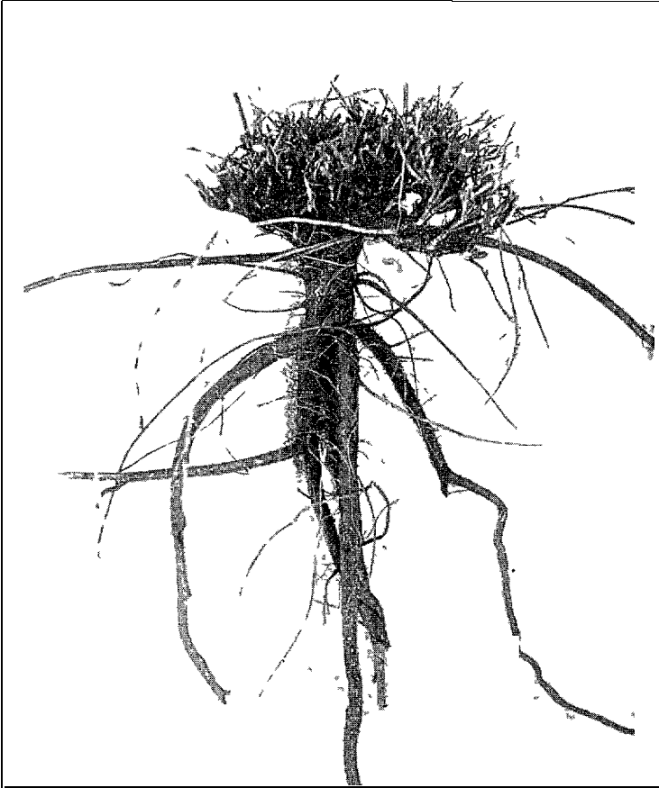
FIG. 4. Crown and root of alfalfa. The plant was seven years old, and grew on upland. It had 104 stalks from the one root.