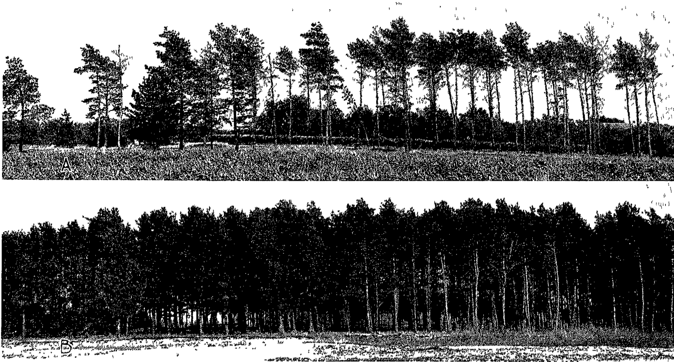
FIG. 1.— Scotch and Jack pine grove on Horticultural Farm planted in 1898. (A) Photograph taken on July 6, 1936. (B) Photograph taken in December, 1929. The Jack pines died during the drouth of 1934. Many of the Scotch pines died during 1934 and 1935.