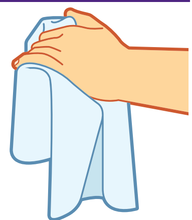
Turn off water with paper towel

For additional information and training schedules visit www.ksre.ksu.edu/producesafety