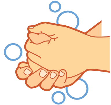
Wash for 20 seconds