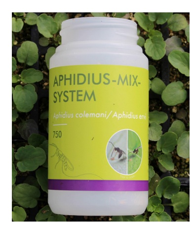
Figure 4. Container with sawdust (carrier) and mummified aphids parasitized by Aphidius colemani and Aphidius ervi.

early in the cropping cycle to manage aphid populations before they reach plant-damaging levels.