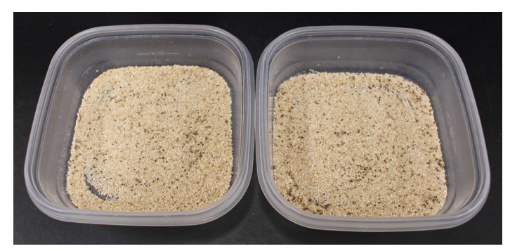
Figure 8. Contents of container with sawdust and mummified (parasitized) aphids evenly distributed between two plastic containers (Raymond Cloyd).