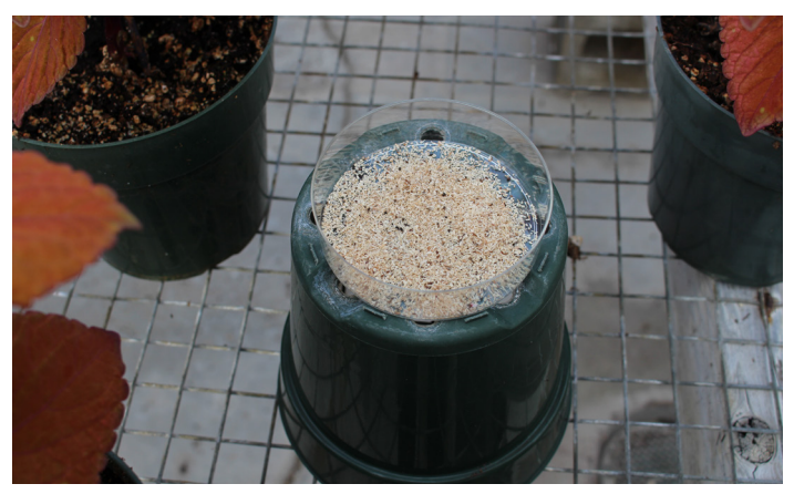
Figure 5. Petri dish with sawdust and mummified (parasitized) aphids placed among a crop (Raymond Cloyd).

Place banker plants among the main crops that are susceptible to aphids or near plants prone to early aphid infestations (Figure 7). The parasitoids will move from the banker plants to the main crops and vice versa. More parasitoid adults will be produced as long as bird-cherry oat aphids are present on the banker plants. A general recommendation is to place two banker plants per acre within the greenhouse. Contact the distributor or supplier