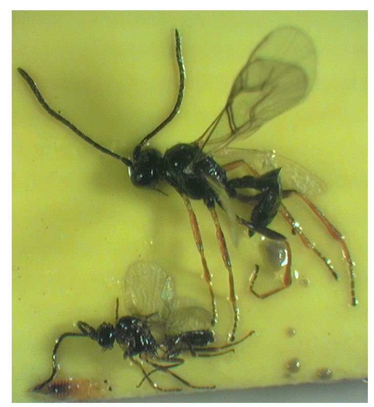
Figure 10. Adult Aphidius colemani (bottom) and Aphidius ervi (top) on yellow sticky square (Raymond Cloyd).

Figure 9B. Aphidius colemani and Aphidius ervi adults captured on yellow sticky square (Raymond Cloyd).