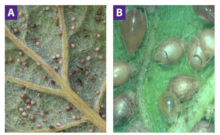
Figure 2A. Mummified (parasitized) aphids on leaf underside (Raymond Cloyd). Figure 2B. Close-up of mummified (parasitized) aphids (Raymond Cloyd).