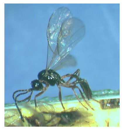
Figure 3. Aphidius ervi adult (Raymond Cloyd).

Aphidius colemani and Aphidius ervi are available from distributors and suppliers of biological control agents as a mixture in containers with sawdust, as the carrier, and mummified (parasitized) aphids. Place the contents of the container near plants infested with aphids (Figure 4) or into Petri dishes distributed throughout the greenhouse (Figure 5). The parasitoids must be released or introduced