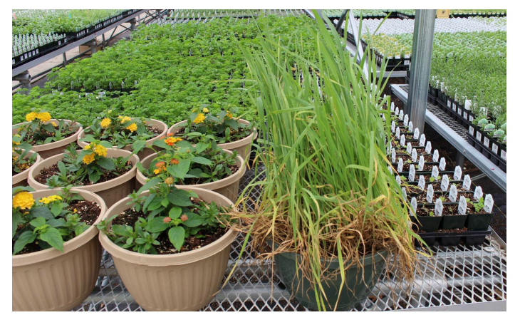
Figure 7. Banker plant placed among the main crops (Raymond Cloyd).