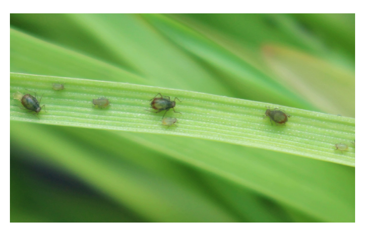
Figure 6. Bird-cherry oat aphids on banker plant (Raymond Cloyd).