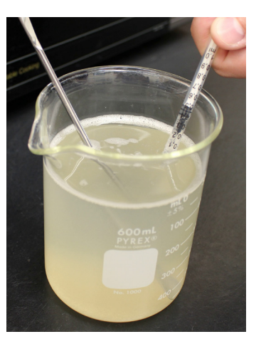
Figure 6. Removing 1.0-milliliter aliquot of solution using 1.0-milliliter syringe.