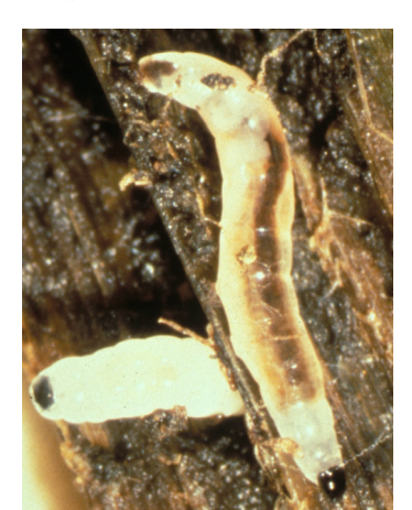
Figure 2. Fungus gnat larva.