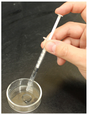
Figure 7. Placing 1.0-milliliter aliquot of solution into glass Petri dish.

Steinernema feltiae is effective in greenhouse production systems when applied before fungus larval populations have established in the growing medium.