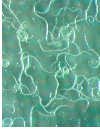
Figure 1. Steinernema feltiae (Photo: Raymond Cloyd).

Steinernema feltiae can be purchased from biological control suppliers as sealed plastic trays containing 50, 150, or 250 million individuals (Figure 3). Check the expiration date on the package. If the expiration date has passed, contact the biological control supplier. Release S. feltiae immediately after arrival to avoid storing for an extended length of time. However, if necessary, store in a refrigerator