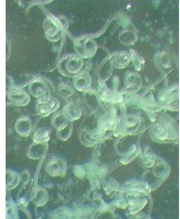
Figure 8. Close up of Steinernema feltiae moving around.