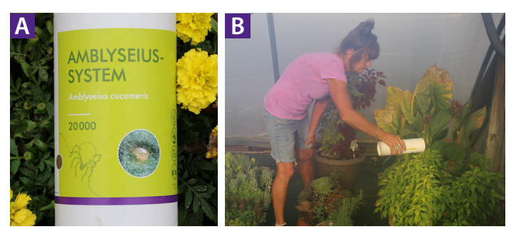
Figure 3A. Label on container of Neoseiulus cucumeris . Figure 3B. Applying Neoseiulus cucumeris manually to plant leaves (Photos: Raymond Cloyd).

Neoseiulus cucumeris feeds on pollen as an alternative food source, which sustains N. cucumeris populations when western flower thrips populations are low or when western flower thrips are not in a susceptible life stage (first-instar