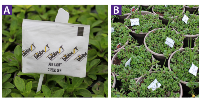
Figure 2A. Sachet or slow-release bag containing Neoseiulus cucumeris adults, nymphs, and eggs.

Figure 2B. Sachets containing Neoseiulus cucumeris placed among a greenhouse-grown crop.