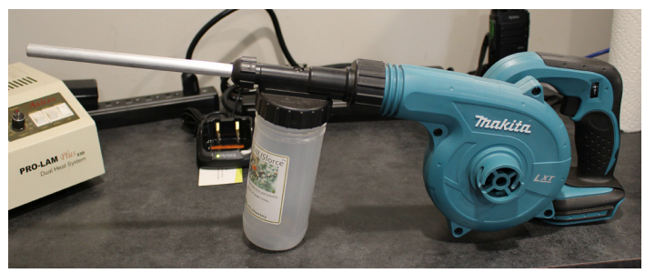
Figure 4. Mechanical blower used to distribute Neoseiulus cucumeris in a greenhouse.

Neoseiulus cucumeris is available in containers of 20,000 predatory mites mixed with vermiculite (Figure 3A). The predatory mites are distributed onto crops by placing them on plant leaves (Figure 3B) or using a blower (Figure 4). Lightly mist plants with water before releasing N. cucumeris so the predatory mites do not fall off plants. Neoseiulus cucumeris takes three to four weeks to establish within a