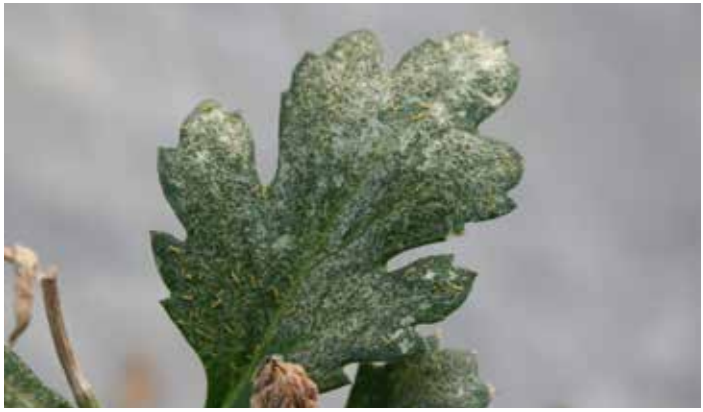
Figure 1. Western flower thrips.

Extensive use of the neonicotinoid class of insecticides increased the likelihood of resistance developing in the Q-biotype of the sweet potato whitefly, Bemisia tabaci (Figure 4). The whitefly has developed resistance to the neonicotinoid insecticides imidacloprid (Marathon), thiamethoxam (Flagship), and acetamiprid (TriStar), and to the insect growth regulators buprofezin (Talus) and