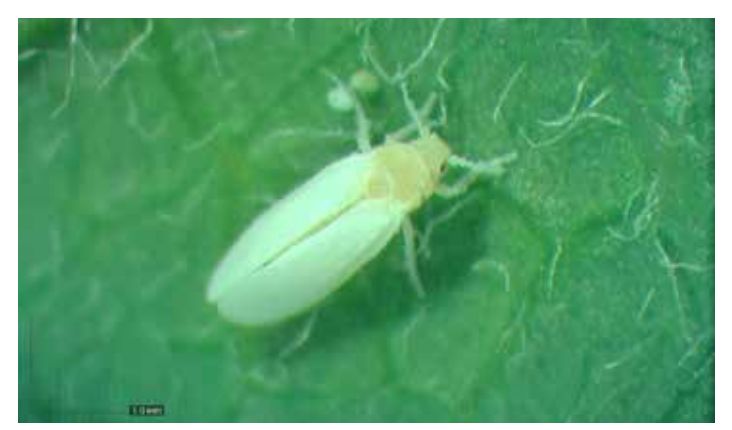
Figure 4. Sweetpotato whitefly adult.

Each successive pesticide application places additional selection pressure on arthropod pest populations, which may further increase the frequency of resistant individuals (Figure 5). Pesticide resistance develops in arthropod pest populations through one of two mechanisms, either metabolic detoxification or physiological changes. Metabolic resistance is the breakdown of the pesticide active ingredient inside the insect body. The metabolic process is triggered by specific enzymes that detoxify or convert the active ingredient into a nontoxic form before the active ingredient is excreted with waste from the body. Physiological resistance involves alterations in the site targeted by the