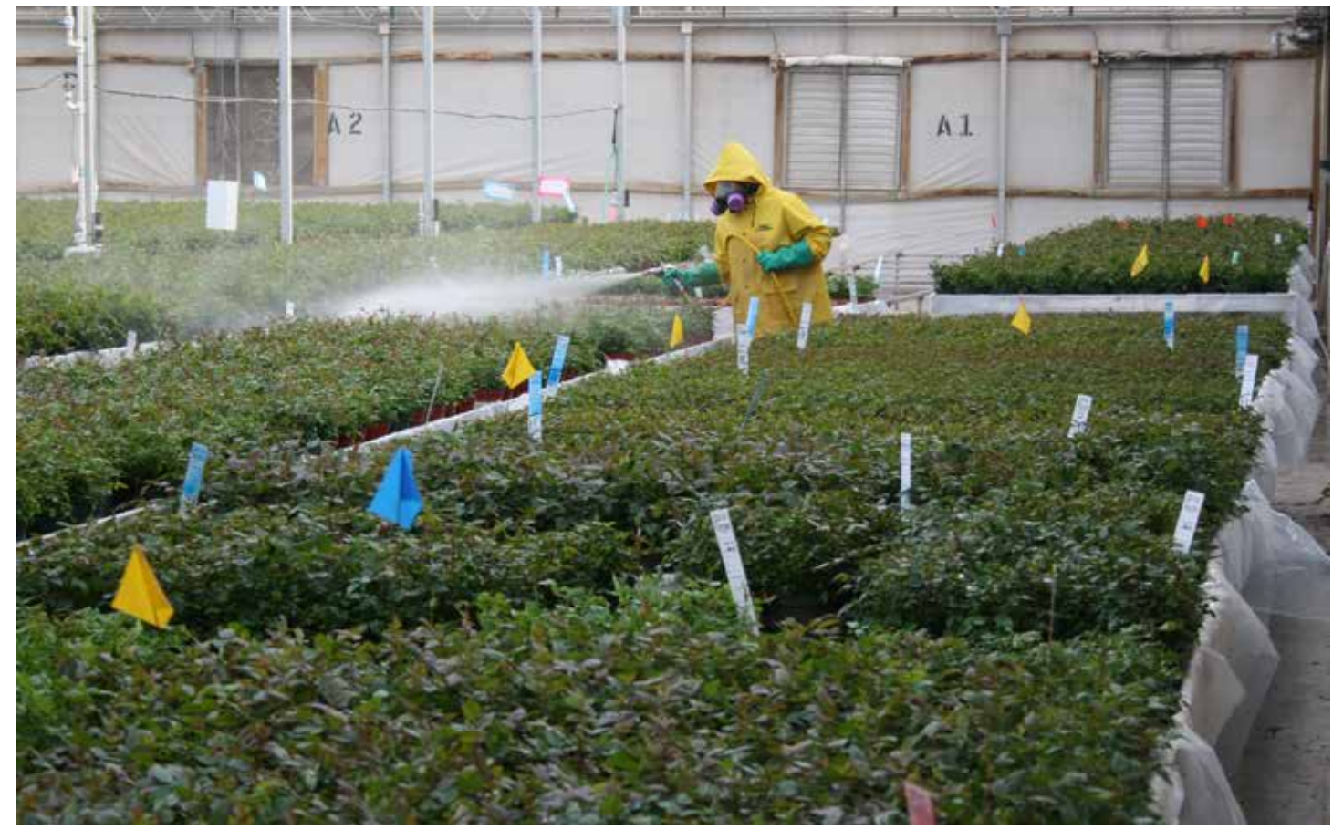
Figure 5. Every time a pesticide is applied selection pressure is placed on arthropod pest populations.

Many arthropod pests encountered in greenhouse production systems have short life cycles (egg to adult) and females have high reproductive rates, both of which contribute to the increased likelihood of resistance developing in arthropod pest populations. Furthermore, in greenhouse production systems arthropod pests can breed year-around with many generations occurring simultaneously, which may warrant more frequent pesticide applications. In general, most pesticides are applied every 5 to 7 days. Despite frequent applications, a certain number of individuals may