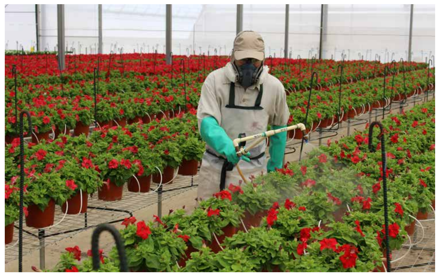
Figure 6. Frequent pesticide applications can result in arthropod pest populations developing resistance.

survive because they are not in susceptible life stages (eggs or pupae) or do not come in contact with spray residues. Any surviving individuals that may be resistant can then breed with other resistant survivors to produce a population of highly resistant individuals that eventually become fully resistant to the pesticide after nearly all susceptible individuals in the population are killed.