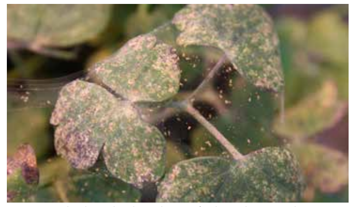
Figure 7. Localized or isolated populations of arthropod pest populations can develop resistance to pesticides.

Arthropod pests such as the twospotted spider mite (Figure 7) that remain on plants to feed may develop resistance faster than thrips and whiteflies, which are more mobile. Resistance develops rapidly because the intense selection pressure associated with frequent pesticide applications reduces the number of susceptible individuals