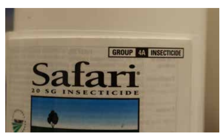
Figure 8. Pesticide products contain information about the mode of action based on the IRAC group designation.

Similarly, insect growth regulators with different modes of action should be rotated. Insect pests such as aphids and whiteflies have developed resistance to a number of insect growth regulators. Three modes of action associated with