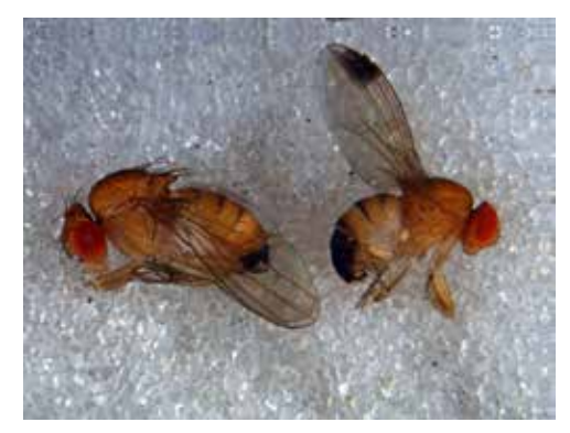
Figure 1. Spotted wing drosophila female (left) and male (right). Males have a black spot near the tip of the forewings, which is absent on females.

Spotted wing drosophila has been detected in high-tunnel production systems, possibly attracted by the warmer temperatures and wind protection provided throughout the growing season. This pest has been known to attack tomatoes in high tunnels, but tomatoes do not appear to be a preferred host crop. Because spotted wing drosophila