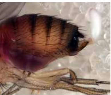
Figure 2. Female serrated ovipositor.

Adult females live approximately 2 weeks and deposit between 100 and 300 eggs from spring through fall. The number of eggs depends on the temperature and the host plant. Life stages are egg, larva, pupa, and adult. Time required to complete the life cycle varies with temperature; warmer temperatures tend to reduce the time required to complete the life cycle. Studies have shown that the spotted