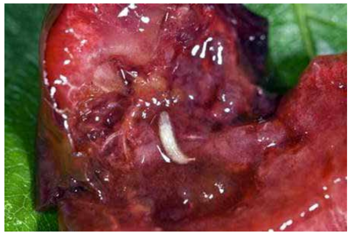
Figure 6. Larva in fruit.

wing drosophila life cycle may take 23 days at 59°F and 10 days at 77°F. Eggs hatch into white larvae (Figure 6) that feed inside berries or fruit for 5 to 7 days. Typically, larvae pupate inside fruit, but they also may pupate outside the fruit unlike other vinegar and native fruit flies. Females are capable of laying eggs almost immediately after emerging.